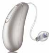
Moxi Move R

They charge just like your favourite electronic devices.