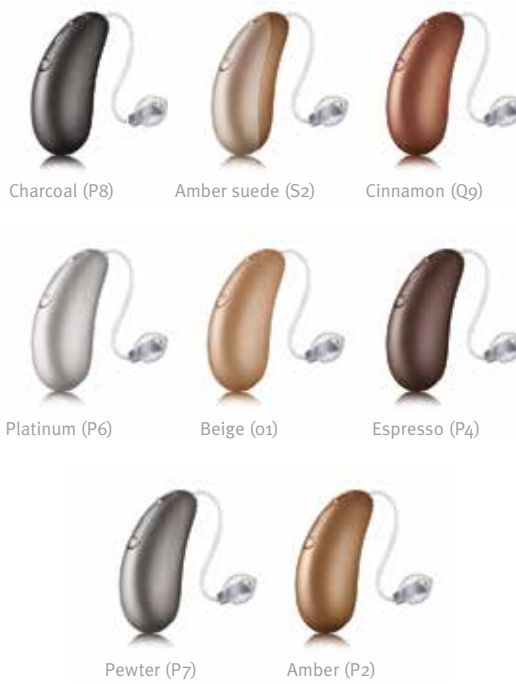
Colours shown with Moxi Move R. Colors also available for Moxi Jump R T, Moxi Fit and Stride P R.