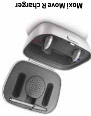
Moxi Move R charger