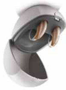
Stride P R charger

Our rechargeable solutions will keep working even when you're ready for bed. And they'll be ready again in the morning before you are, thanks to proven lithium-ion rechargeable technology you can rely on.