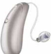
Moxi Jump RT